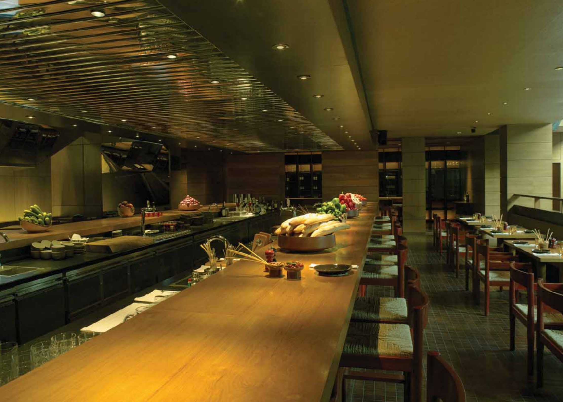
The Lodhi steps lead down to Tapas. This casual venue with its central service area offers a wide selection of tapas and a lively ambience. There is also a semi-private dining room, ideal for intimate gatherings.