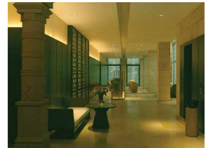
The subtly lit arrival lounge and reception area set the tone for the rest of the resort in terms of décor and ambience. Lofty ceilings and a neutral palette emphasize the abundance of space while cool glass and stone contrast with the warmth of rich fabrics and wood to create a harmonious sense of restrained luxury.